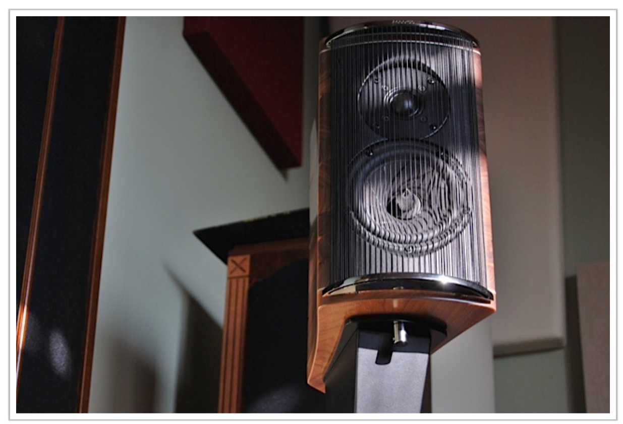
Just in the right angle

Accordos are very open and they disappear in the room like no monitor speakers I heard so far. Perhaps a part of this might come as psychological imprint of their arch like shape. Anyhow, placebo and imprints disappear after some time and their physical absence while listening was still strong and circled boldly red with marker in my listening notes. I guess they're for different set of ears then Guarneri Evolution's. It's hard to give any labels and I'm trying really hard not to fall in any of audio guru resemblance. Then again expression have to be written and I dare to conclude, that Accordos are made for uninterrupted enjoyment of acoustical music. They're refined instruments for those seeking an intimate exchange of emotions between performers in real spaces with real instruments and listener.