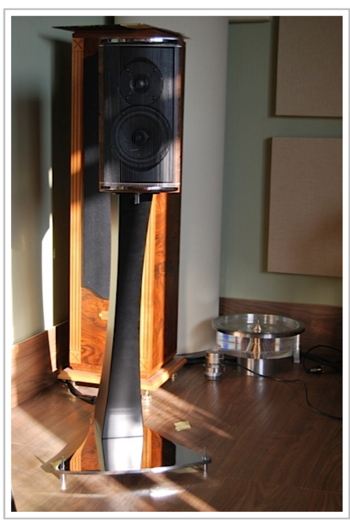
Reference turntable, Accordo, Acoustic Preference Maestoso 2.0

These are two completely different speakers and yet in a way they're both connected somehow. While Sonus Faber Guarneri Mementos are still in production Sonus Faber Guarneri Evolution can be seen as logical successors of them. Something like a third generation Guarneri's. Both speakers are remarkable sight candies and true eye catchers. Red violin on Sonus Faber Guarneri Evolution is one of the kinds and finish alone is making it the most prominent looking speaker when it comes to the share quality and aesthetics of wood finish and lacquer. Now, if we take size of those two under the scope it's obvious, that Guarneri Evolution will be a quick winner in reproduction of lover bass notes, octaves and their impact on music reproduction. Guarneri Memento's had an enormous bass; way beyond their physical size and many people was always looking for hidden subwoofer. There was none, It's the same with Evolution, Combination of great stand and speaker alone is working greatly in the service of bass. Guarneri Evolution will also performed much more friendly in larger listening environments then Accordos. No brainer here.