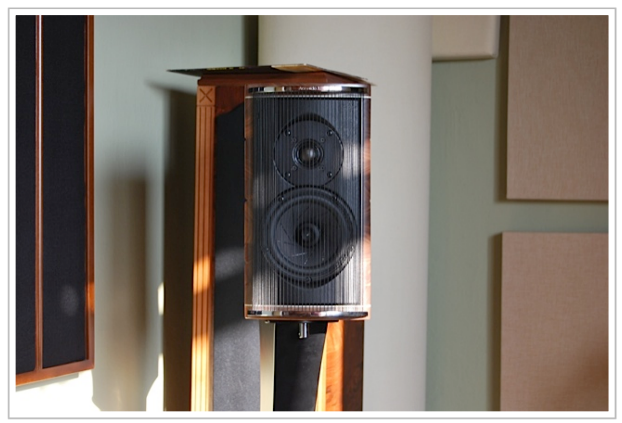
Ready for music in a tuned Mono & Stereo demo room

Franco Serblin Accordo might be considered light feathered when compared to some other two-way monitor speakers. Even with their gorgeous stands they're still not heavy to move when their need to be adjusted within the room. Weight shouldn't be all that important... It's all in the construction; know how and at the end in the sound that should matter the most. Your affection to Accordo's might vary. With their unique arch shaped enclosures they're breathing with different aura, but for me this is one of the best looking small monitor speakers. Their elegance, the Italian playful lines, integration of mirror brushed aluminum and chrome. Everything feels so refined. Accordo's acts as a true Barons with their appearance, elegance and noble heritage. There is nothing casual about them. For their appreciation you'll have to move out of labeling and go all art passionate, even Tuscany feeling like. There is certainly no mistake about, which brain hemisphere is in the work here.