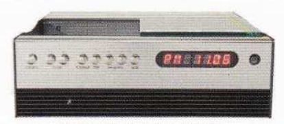
AURA NOTE V2