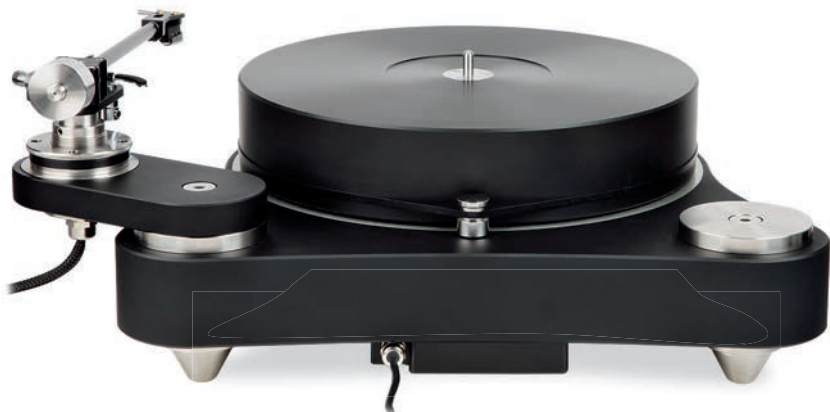
ABOVE: The Raven GT's motor is positioned very close to platter for the shortest belt routing, maximising the benefit of its high torque and aiding long-term stability

for my copy of The Magic Flute [EMI SLS912] and to cue up the Queen of the Night's demanding aria from Act 2. I am glad I did, as the sheer majestic force of the vocal performance had me pinned back in my seat. There was no sense of over-exertion from the Raven pairing, just a huge wave of sonic grandeur thundering out of my loudspeakers.