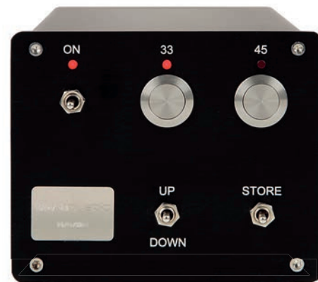
ABOVE: The DC power supply has incremental speed adjustment for 33.3 and 45rpm