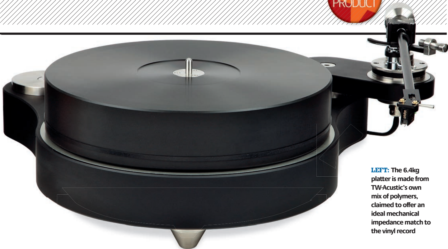
LEFT: The 6.4kg platter is made from TW-Acoustic's own mix of polymers, claimed to offer an ideal mechanical impedance match to the vinyl record

further collar that can be independently removed to allow for ease of arm-changing – the only exception being the SME mounting which is too large to be accommodated by one of the insert billets.